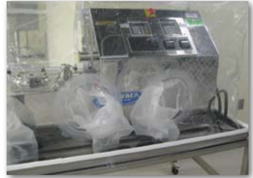
Solid Pan Mount Total Encapsulation Selected for Granulator

Solid pan mounted enclosures allow the entire piece of process equipment to be contained. The enclosure is supported by an elastic suspension system, attached to the pan, and includes glove sleeves for access to the equipment and integrated HEPA filters. Based on the suspension system, the operator is able to get in close proximity to the process, as if containment wasn't even present.