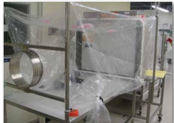
Flange Mount Flexible Containment Selected for Tray Dryer

The flange mount approach is used for the tray dryer where the flange is added to the face of the dryer outside of the door. An enclosure made from the rugged ArmorFlex® family of films is then attached to the flange and a supporting frame assembly. The door is within an enclosed environment when loading and unloading the trays with the drug product.